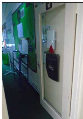
Door to corridor