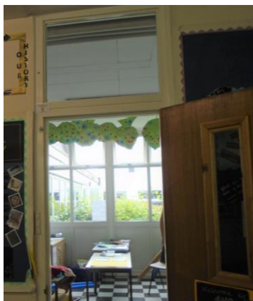
Door to corridor